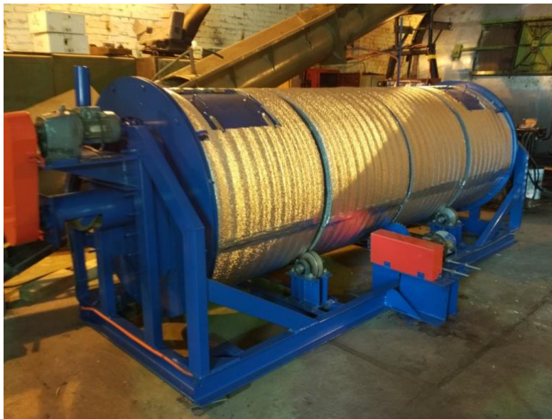
Fig. 2. Drum-type bio-fermenter

animals and poultry, to be used as organic fertilisers” [16-18]. The economic effect was defined as the net profit of the small farm introducing this processing technology.